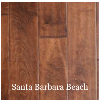
Santa Barbara Beach