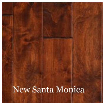
New Santa Monica

Detailed Installation Care and Warranty available to download at: www.slccflooring.com