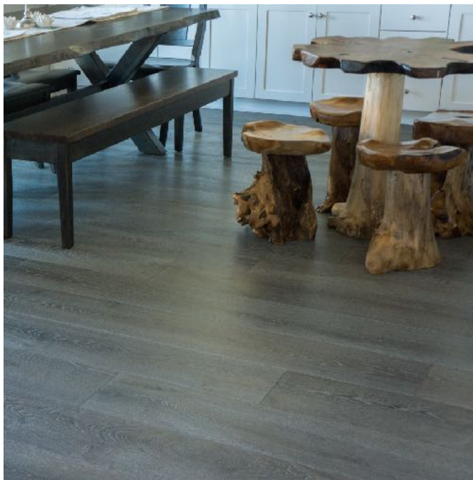
Heavy Textured Wood Flooring

Stunning visual of a reclaimed characted flooring complete with partially filled knots, cracks and fills.